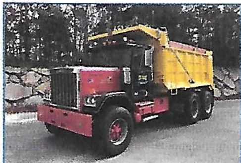
2022 Dash Plaque & T-Shirt Truck Greg Moniz - 1985 GMC 5 Star General

Vehicle Registration: Pre-Reg: $10 per vehicle Day of Show: $20 per vehicle