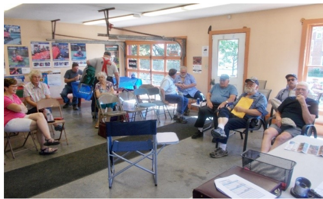
We all appreciated the COOL air conditioning on a very hot July afternoon! An unexpected treat.