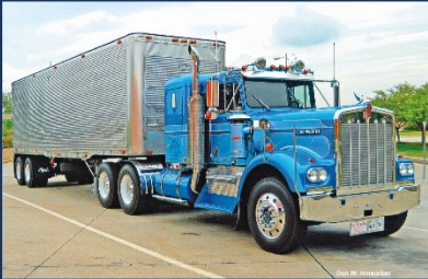
Freight Haulers 7 Donald W. Arnauckas

NEW Release in the Golden Age of Trucking in Photos series by Don Arnauckas. Features 82 color and Black & White photos from the 1940's thru the 1990's. Trucking companies and private fleets from the Northeast. Send check or money order for $35 plus $7 postage for each book ordered to Golden Age of Trucking Publishing, 14 Avalon Ave., Oakville, CT 06779-2002. Other books in the Golden Age of Trucking series are available. Phone 860-274-4758 or email to dwatrans@sbcglobal.net