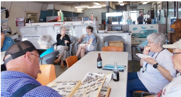
Delicious lunch & good conversation