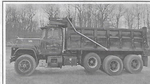
WACHUSETT TRUCKING - 1988 MACK RD TO BE FEATURED ON THIS YEARS DASH PLAQUE AND SHOW T-SHIRT