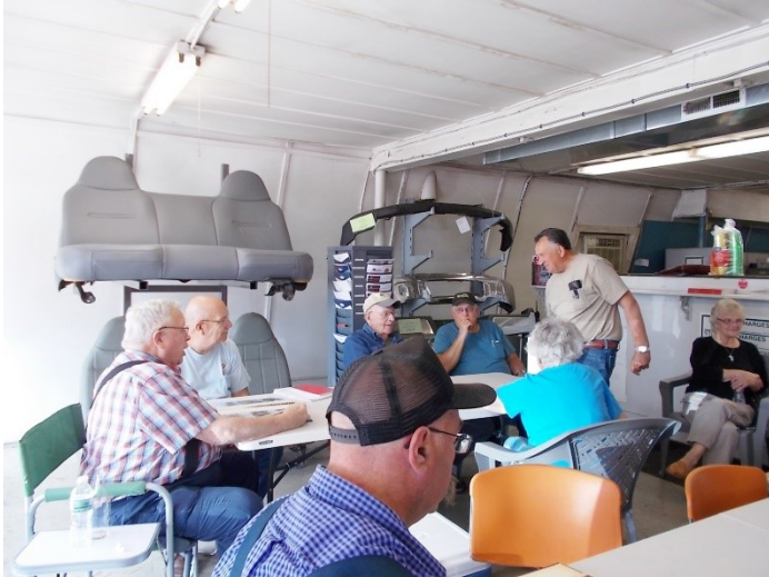
Catching up with good friends on a Sunday afternoon.